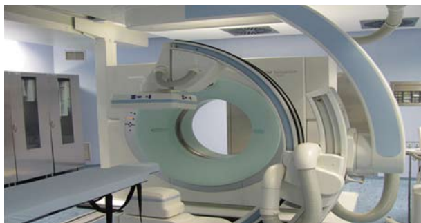
Hybrid Operation Room at the NCI of Bari

Istituto Tumori Giovanni Paolo II, Istituto di Ricovero e Cura a Carattere Scientifico Viale O. Flacco, 65 70124 Bari Italy